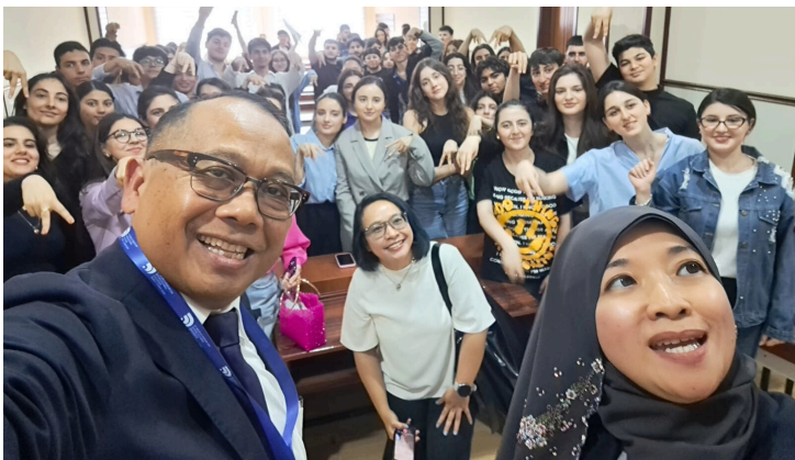
ASEAN-IPR ED also introduced the work of the Institute with a visit to Baku State University together with the Secretary General of the ASEAN Inter-Parliamentary Assembly (AIPA).

Baku, 1-3 May 2024 – The Executive Director (ED) of the ASEAN-IPR participated in the 6th World Forum on Intercultural Dialogue in Baku, Azerbaijan. The forum, themed "Dialogue for Peace and Global Security: Cooperation and Interconnectivity," provided a platform for discussions on fostering peace in a globally interconnected world.